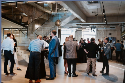
Digital Crossroads: Switzerland x Estonia in Tallinn