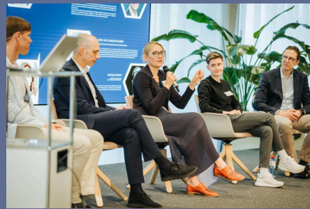
Long Game – Creating Durable Enterprises in HSG

What an extraordinary year 2025 has been for the Estonian Chamber of Commerce in Switzerland — a year defined by powerful connections, historic milestones, cultural celebrations, and a truly vibrant Estonian–Swiss–Nordic business community .