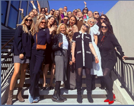
Nordic Business Ladies Brunch in LUX