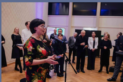
Arvo Pärt 90 Jubilee Reception in Tonhalle Zürich