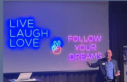
Swiss Property Market & Capital Gain in Zug